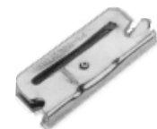
FE8029-1 Series E/A Spring Loaded Fitting. 4500 lbs. Breaking Strength. 1500 lbs. WLL.