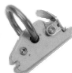
FE8264-1 Series E/A Fitting with 1" Round Ring. 6000 lbs. Breaking Strength. 2000 lbs. WLL.