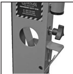
Simple to use knob