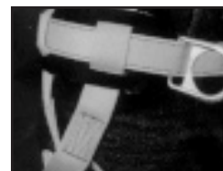
Adjustable comfort pad.