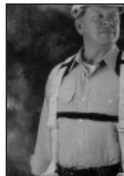
Heavy duty harness, DH3D. Removable waist belt.