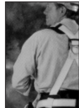
Heavy duty harness, DH3D.