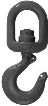
Suitable for frequent rotation under load.